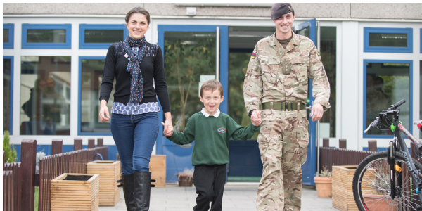
DIRECTORATE CHILDREN AND YOUNG PEOPLE - All our children and young people flourish and achieve their full potential

The CEAS team is comprised of qualified teachers and experienced case advisors who can answer queries predominantly via email and telephone.